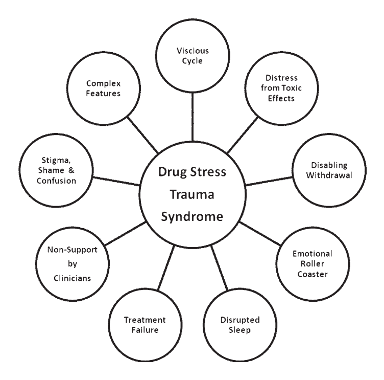
Fig. 1. Drug Stress Trauma Syndrome components.

regarding inclusion or exclusion of disorders are made by majority vote rather than by indisputable scientific data.